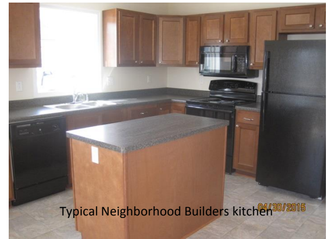
Typical Neighborhood Builders kitchen