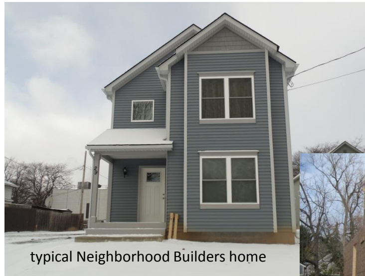
typical Neighborhood Builders home

Neighborhood Builders is a program of the Greater Rochester Housing Partnership